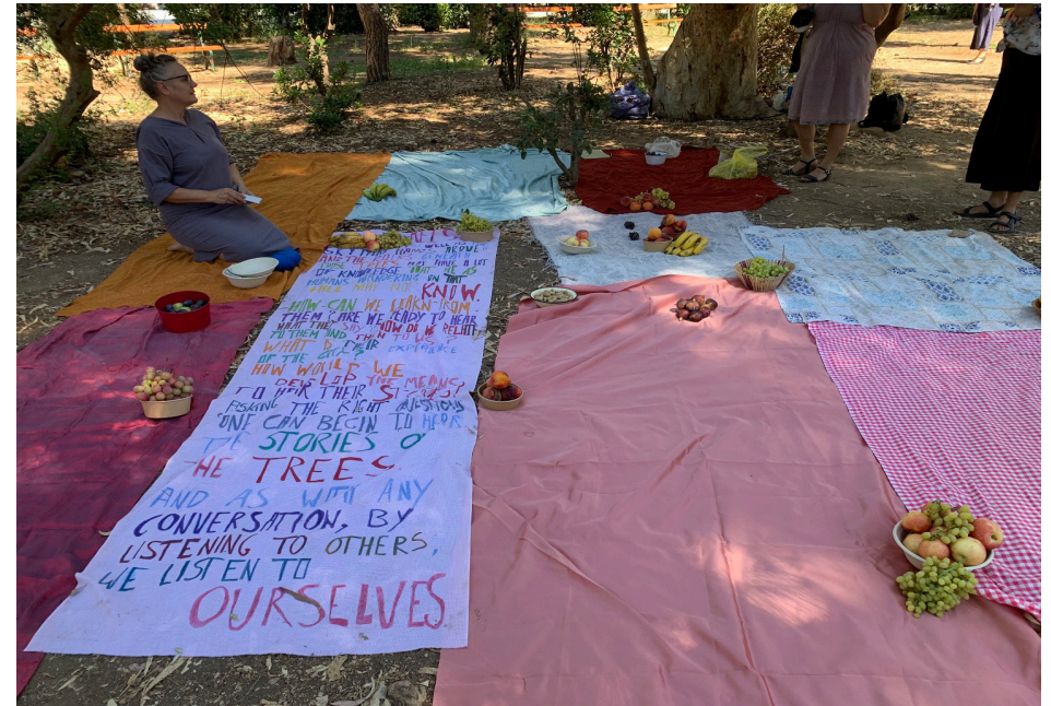
Mouries under the Trees:

At the basis of magic was an animistic conception of nature that did not admit to any separation between matter and spirit, and thus imagined the cosmos as a living organism, populated by occult forces, where every element was in "sympathetic" relation with the rest. In this perspective, where nature was viewed as a universe of signs and signatures, marking invisible affinities that had to be deciphered, every element — herbs, plants, metals, and most of all the human body — hid virtues and powers peculiar to it. Silvia Federici