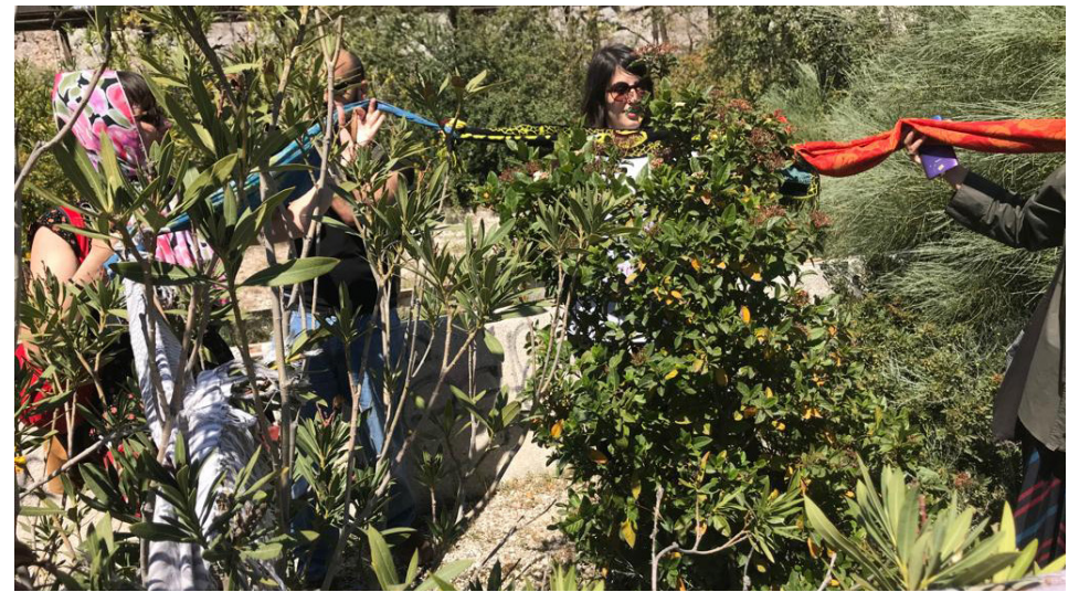
12sqm: Filopappou's Hidden Flowers

Performative walk around the neighbourhood of Koukaki and Filopappou Hill and exhibition at Or.artspace.