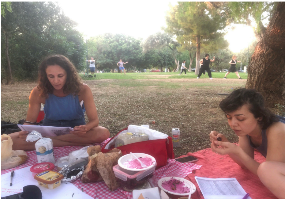
Pic-nic and collective reading